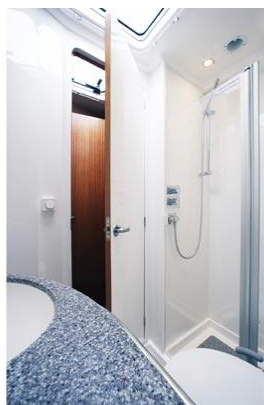
Manufacturer Provided Image: Head