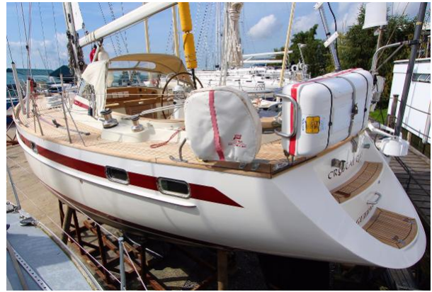
For sale with BSI - Najad 391