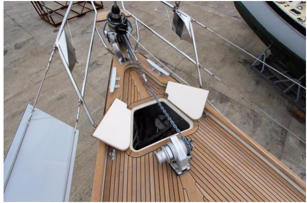
For sale with BSI - Najad 391