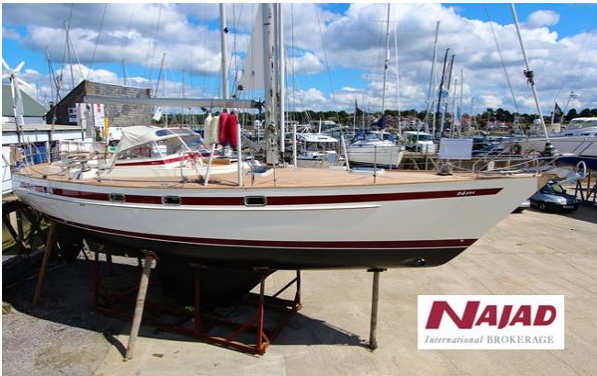
For sale with BSI - Najad 391