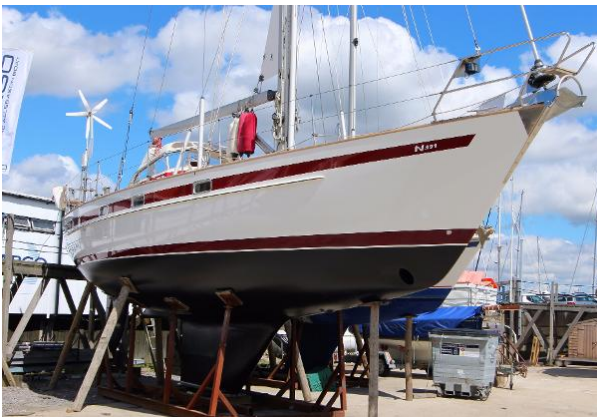
For sale with BSI - Najad 391