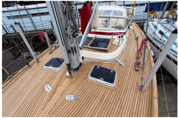
For sale with BSI - Najad 391