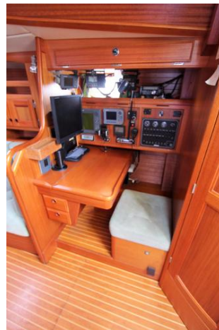
For sale with BSI - Najad 391