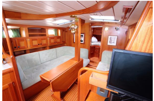
For sale with BSI - Najad 391