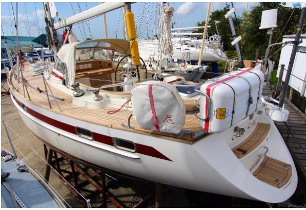
For sale with BSI - Najad 391