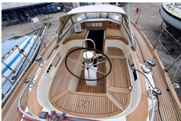
For sale with BSI - Najad 391