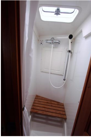
For sale with BSI - Najad 391