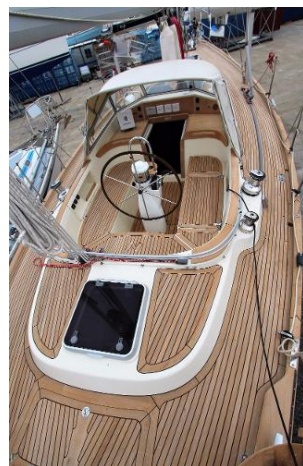
For sale with BSI - Najad 391