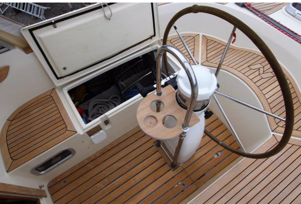
For sale with BSI - Najad 391