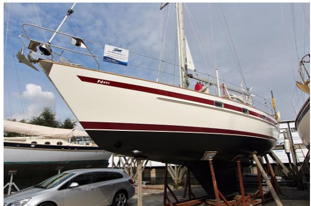
For sale with BSI - Najad 391