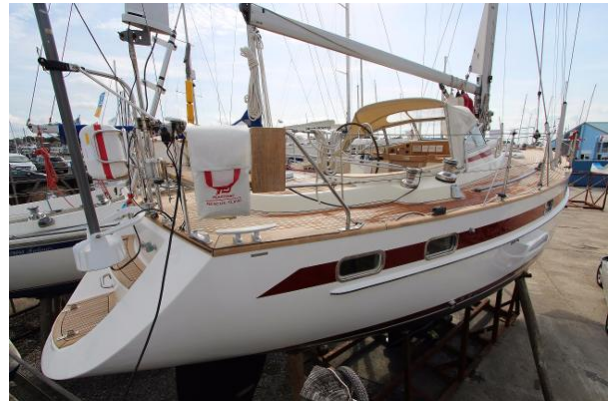
For sale with BSI - Najad 391