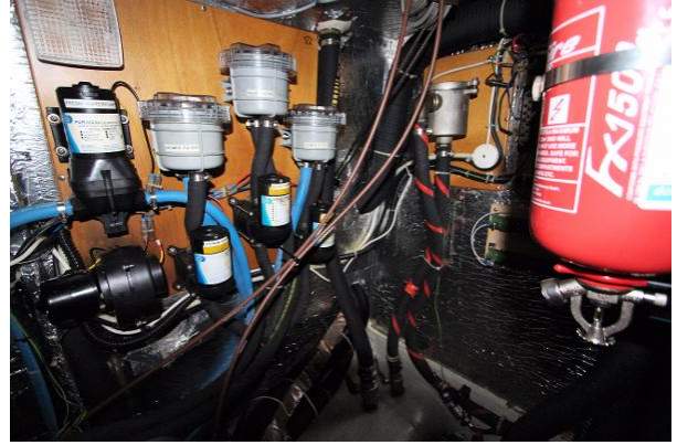
For sale with BSI - Najad 391