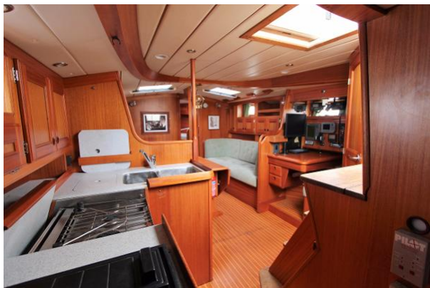
For sale with BSI - Najad 391