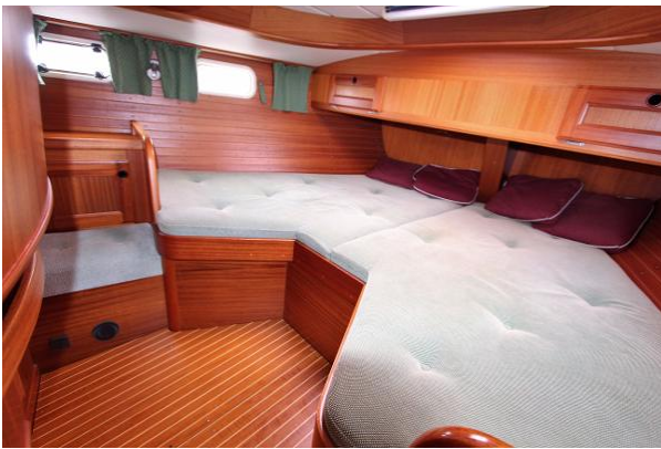
For sale with BSI - Najad 391