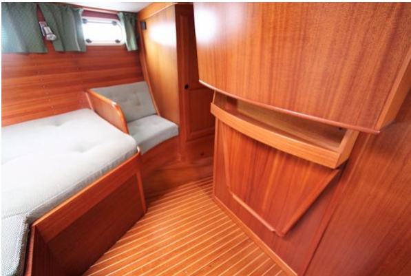
For sale with BSI - Najad 391