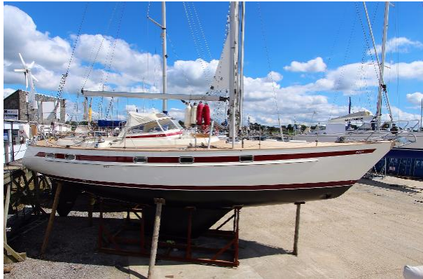
For sale with BSI - Najad 391