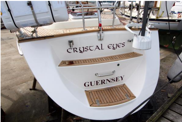
For sale with BSI - Najad 391