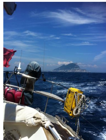
2002 Najad 373 Fast and safe sailing!