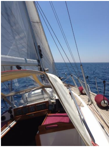
2002 Najad 373