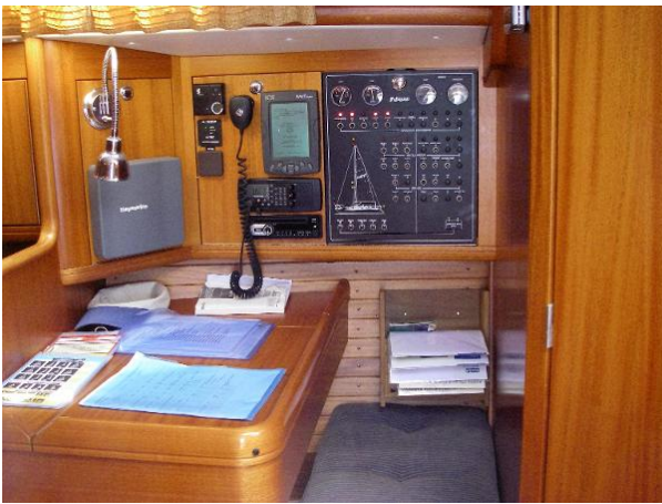
2002 Najad 373 Chart table