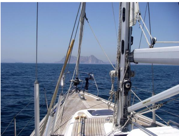
2002 Najad 373 In-mast furling