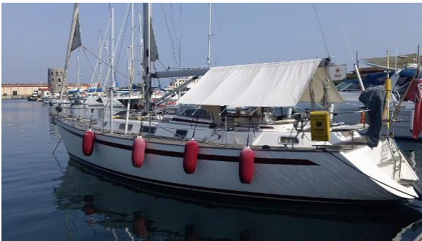
2002 Najad 373 - Port Quarter