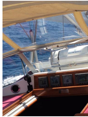
2002 Najad 373 - ST 60 instruments