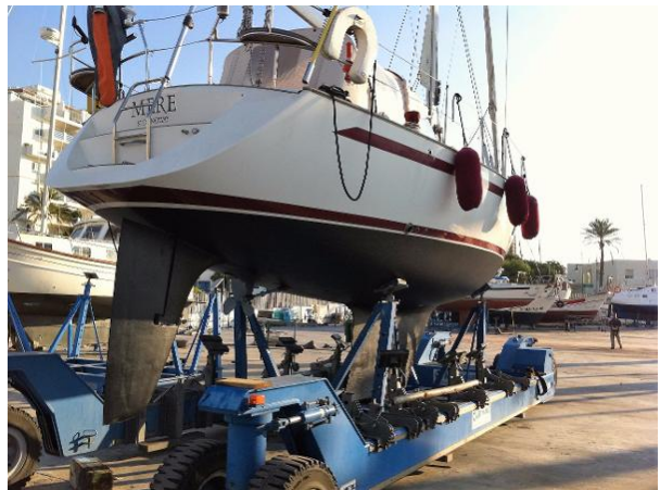
2002 Najad 373 rudder