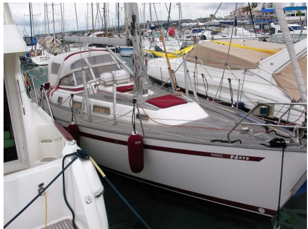
2002 Najad 373 Foredeck