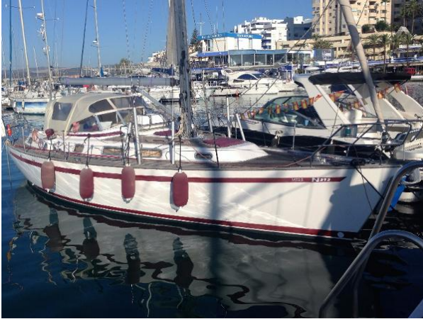
2002 Najad 373 Starboard bow