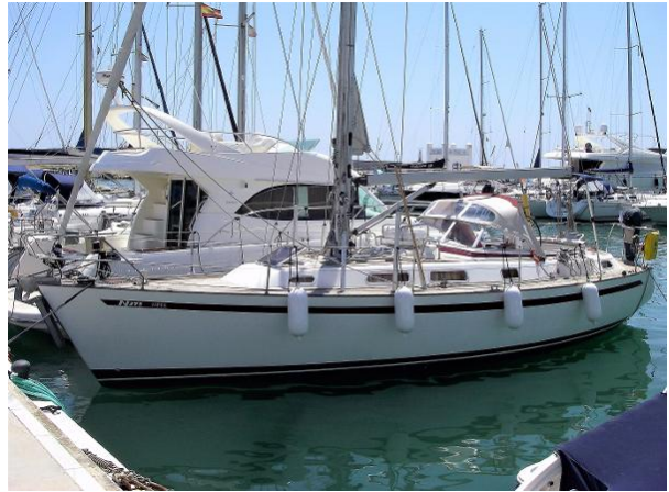
2002 Najad 373 - Port side