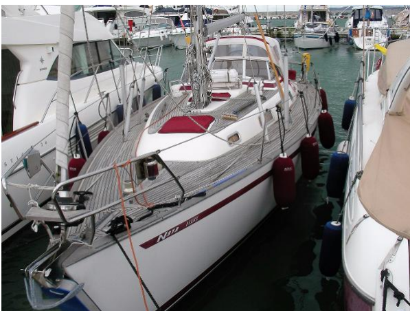
2002 Najad 373 Port bow