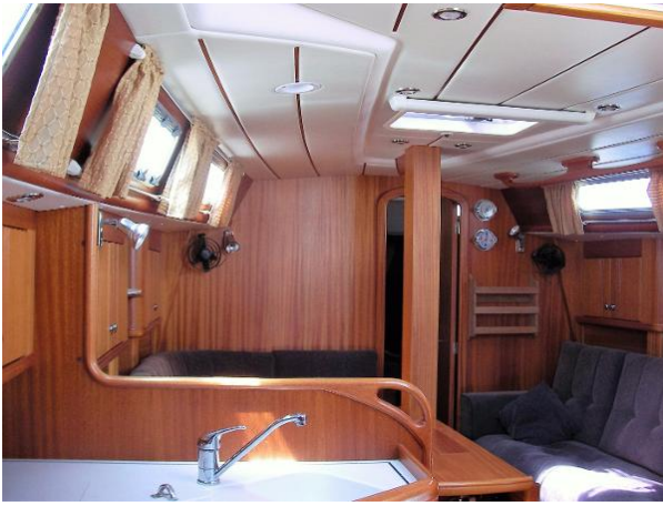
2002 Najad 373 Saloon