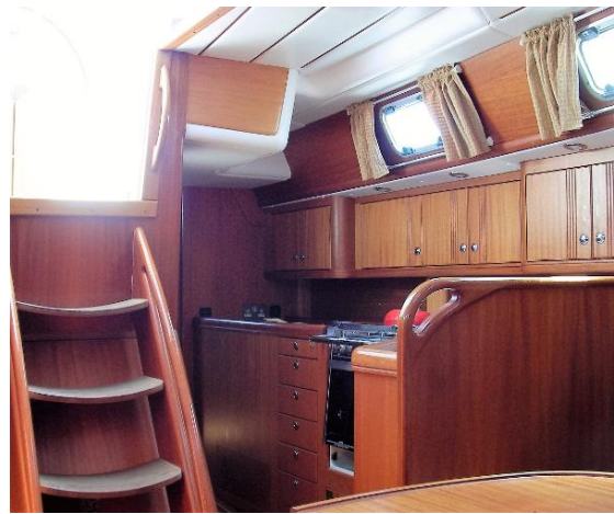
2002 Najad 373 Galley