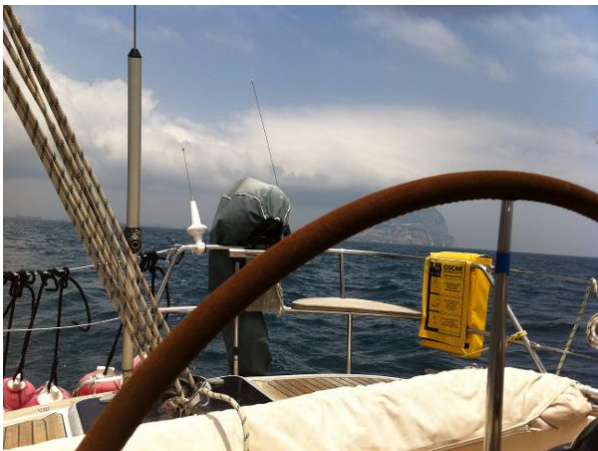
2002 Najad 373 seat on pushpit