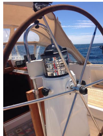
2002 Najad 373