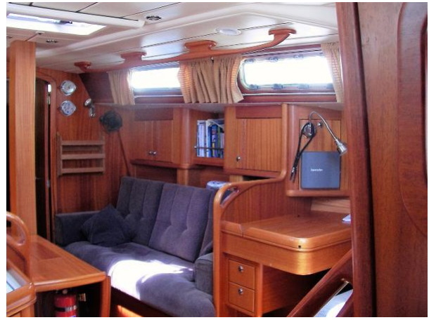
2002 Najad 373 Starboard saloon