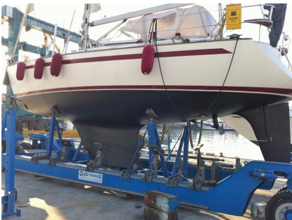
2002 Najad 373 out of the water